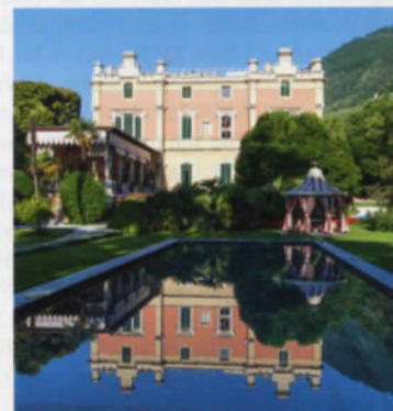
'Prestige' bed by Rugiano Interiors; 'Wilby' candlestick from Julia Boston Antiques; polychrome '01' rug by El Ultimo Grito for Christopher Farr; pool view at Grand Hotel a Villa Feltrinelli