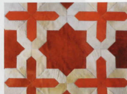
From top: flooring by Dinesen; 'Lounge' chair by Linley for Summit Furniture; Moroccan rug by Whistler Leather;