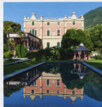
'Prestige' bed by Rugiano Interiors; 'Wilby' candlestick from Julia Boston Antiques; polychrome '01' rug by El Ultimo Grito for Christopher Farr; pool view at Grand Hotel a Villa Feltrinelli