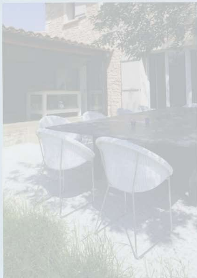
These 'Gigi' chairs from Vincent Sheppard are made from specially treated stainless steel, with a woven seat that has been fully weatherproofed with outdoor paint and latex. The chairs measure 82 x 62 x 57cm and cost £370 each. They are available in snow (seen here), broken white, beige, taupe or quartz grey. Vincent Sheppard (tel: 00-32-56 46 11 14; www.vincent-sheppard.com )