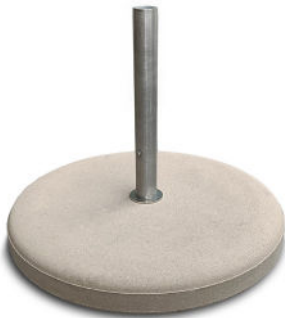
Concrete - Natural