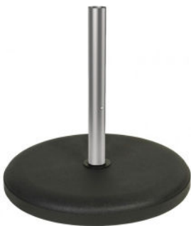
Black - Ral 9005