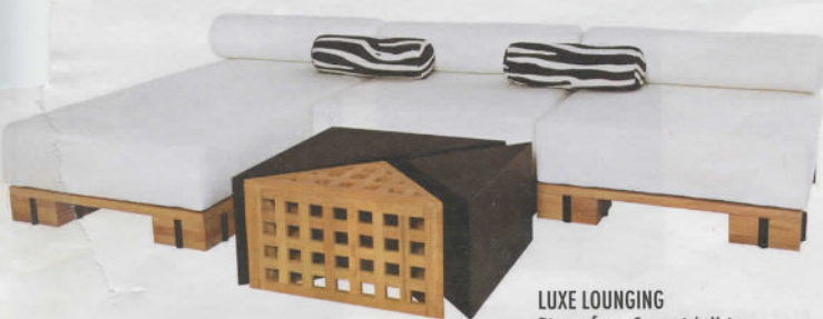
LUXE LOUNGING Pieces from Summit's Krios collection can be put together to create a comfy sectional.

For its latest collection of luxury teak furniture, Summit turned to Modesto-based designer Conrad Sanchez. The line, called Krios, includes a lounge chair, a chaise and a three-piece coffee table—and putting two chaises side-by-side creates the ultimate daybed. Generous proportions and deep cushions offer the plush comfort for which Summit is known, combined with a sophisticated new style that's at once hip and grown-up. From $3,340, 831.375.7811, summitfurniture.com