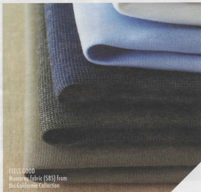
FEELS GOOD Monterey fabric ($85) from the California Collection