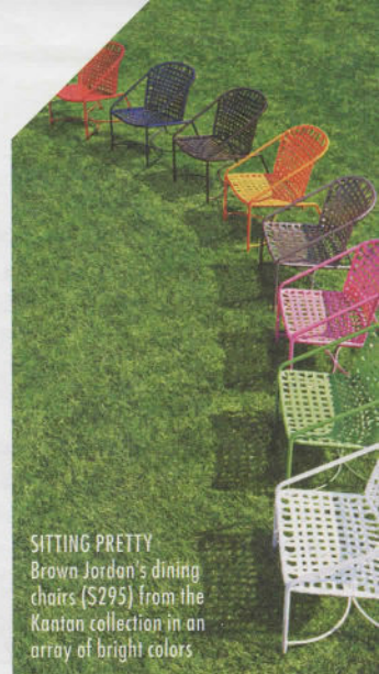
SITTING PRETTY Brown Jordan's dining chairs ($295) from the Kanton collection in an array of bright colors