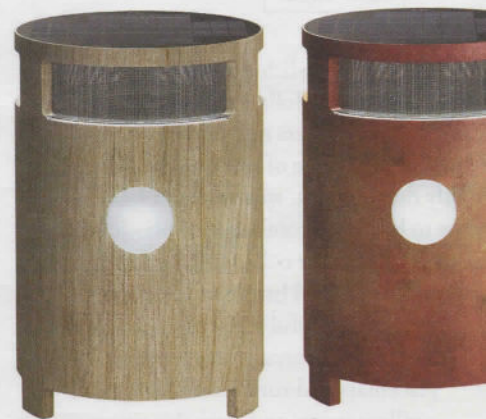
MAKE SOME NOISE The Om Sound System by Matteo Bazzicalupo for Avant*Garde

In honor of its 70th anniversary, luxury outdoor furniture company Brown Jordan is introducing an updated edition of its iconic Kanton collection. Ranging from ottomans ($395) to dining tables ($545) and adjustable chaises ($1,195), the line is now available with mix-and-match frame finishes and 12 vibrant colors of its signature woven vinyl lace. 3323 Hyatt Ave., Costa Mesa, 949.760.6900, brownjordan.com